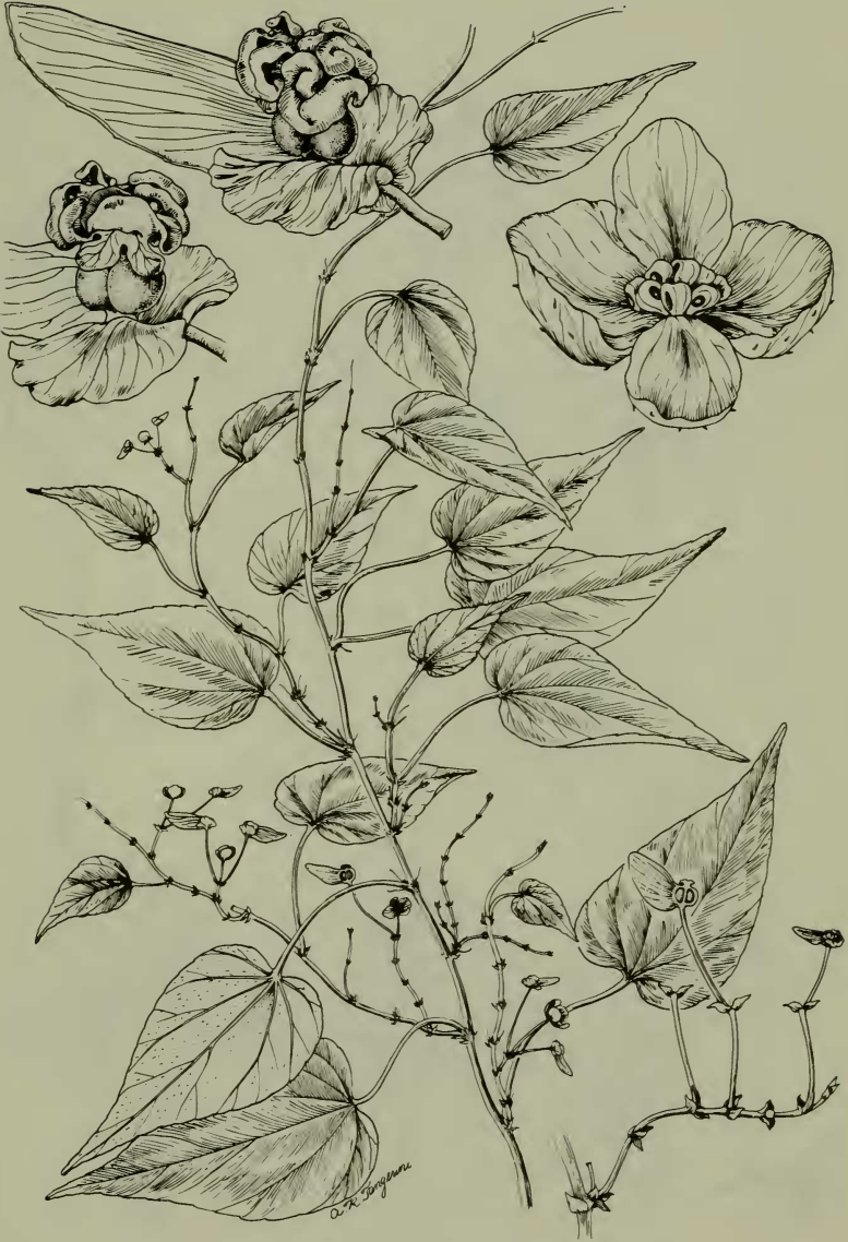
Begonia secunda L. B. Smith & Wasshausen